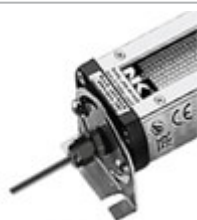
Versione WIDE1 P con M12 connector at 4-pin