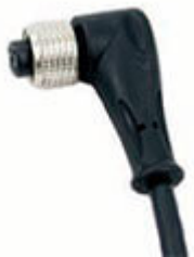
90° Female connector with power cable 5mt