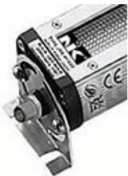
Versione WIDE1 C con M12 connector at 4-pin