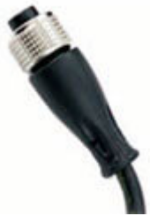
Straight Female connector with power cable