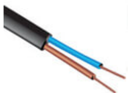
cable without Plug