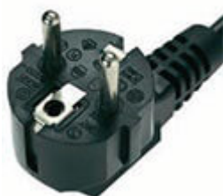
Cavo con spina Schuko