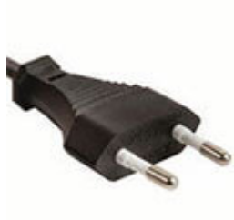
Cable with Euro A10 Plug