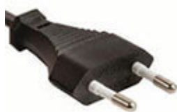
cable with Euro A10 Plug