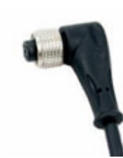
90° Female connector with power cable 5mt