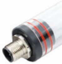
M12 connector at 4-pin