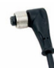
90° Female connector with power cable 5mt