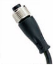
Straight Female connector with power cable