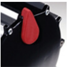
Ergonomic on/off switch