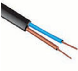
Cable without Plug