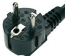
Cable with Schuko Plug