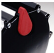
Ergonomic on/off switch